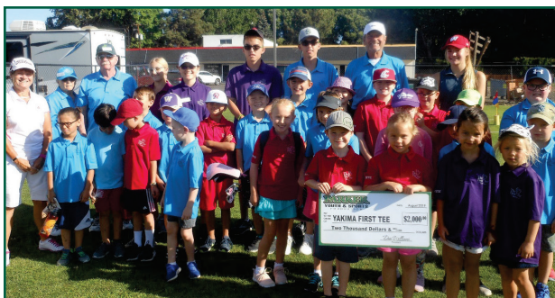
First Tee participants and staff were on hand for the presentation.