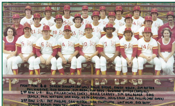
The 1976 Yakima Valley College Northwest Athletic Conference Championship Team

3 on 3 Yakima Hot Shots White Swan Wrestling Central Valley Lacrosse Wine Country Crush Club Lokahi Volleyball Roller Derby East Valley Youth Baseball Yakima Little League First Tee of Yakima Yakima Parks & Recreation Friends of Tieton Yakima Stealers (Fastpitch) Henry Beauchamp SE Community Center Yakima Valley Baseball (Pak) Kiwanis Park Field Development Yakima Valley Sports Commission LaSalle Athletics Yakima Youth Baseball Mabton Park Yakima Youth Soccer Sports Madison House (UGM) YMCA Riverside Christian School YVC Athletics & Scholarships Selah Parks Zaepfel Stadium Seats Wapato High School Basketball Girls team Zillah Youth Baseball West Valley Dance White Swan Community Skate Park